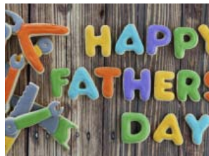
Ready To Celebrate Dad?