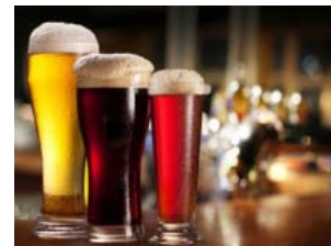
Top Bars To Get Local Beer