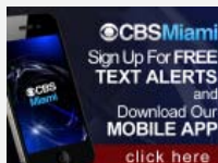
CBSMiami Text Alerts