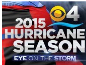
CBS4 Hurricane Guide