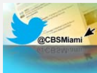
Follow Us On Twitter