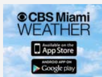
CBS4 Weather App for iPhone & Android