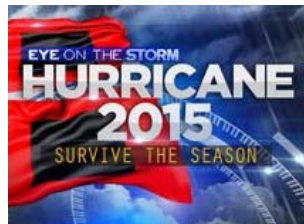
Watch It Now!

Tolls will take drivers off the highways. That's a good thing. It relieves traffic which means those of us who are trying to get somewhere quickly will. A better protest